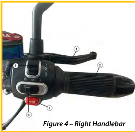
Figure 4 – Right Handlebar