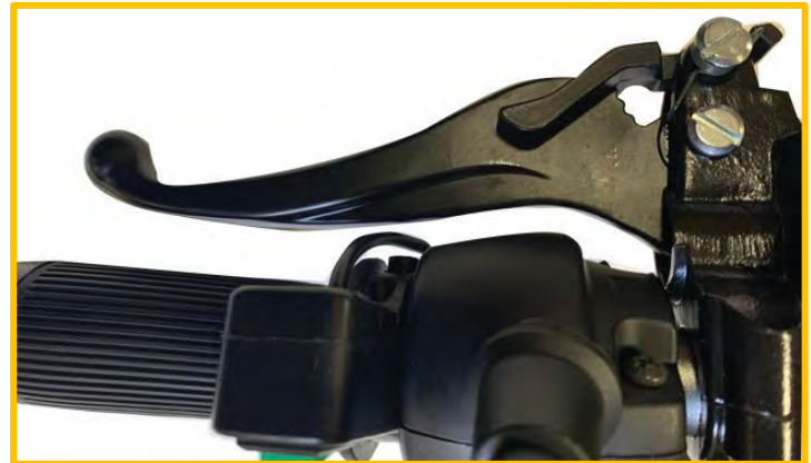
Figure 11 – Brake lock