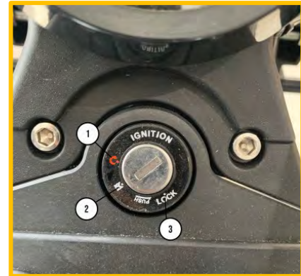
Figure 6 – Ignition barrel