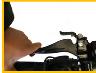
Figure 9 – Brake lock

To disengage the brake lock, just pull the brake lever towards you slightly more and the brake lock latch will pop out. Release the brake lever and you are ready to go!