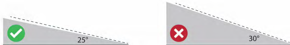
Figure 1 – Recommended inclines

The Invader can climb inclines of up to 25° without danger. On this 25° incline, the Invader can stop, brake and turn. To reduce the possibility of tipping backwards on inclines, lessen the load on the back of the scooter by sliding the seat forward as much as possible and leaning forward.