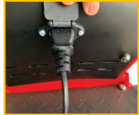
Figure 11 – Charging port

If there are long periods where you decide not to use your scooter, we recommend that batteries are charged at least once a fortnight. This will ensure they remain healthy and are ready for regular usage.