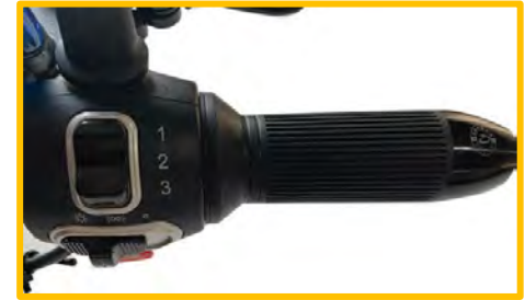
Figure 7 – Throttle lever

To slow down or stop, release the throttle lever and the Invader will stop. In an emergency the hydraulic disc braking system can be activated by pulling the brake levers located on the left and right side of the handlebar.