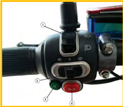
Figure 3 – Left Handlebar