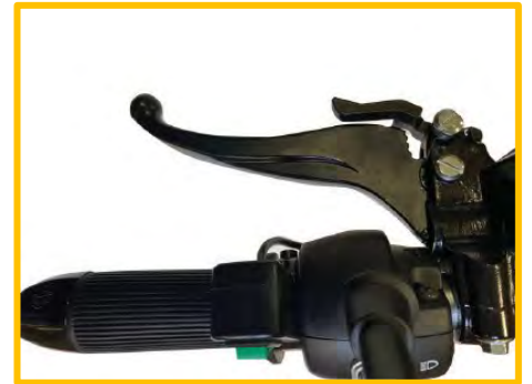
Figure 8 – Brake lever