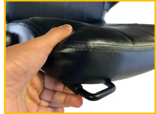
Figure 5 – Seating position adjustment handle

Push firmly against the floor with your feet or pull on the handles mounted to the doors.