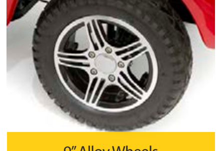
9" Alloy Wheels

Bright Rear LED Lights Dual-Speed Windscreen Wiper Durable Floor Mats Easy Access Doors Electronic Braking System External Charging Cable (0.7m) Finger & Thumb Controls Follow-Me-Home Lights Four-Way Adjustable Driving Position Large Cup Holder Smooth Acceleration System Super 1400 Watt Motor Trip Computer Twin USB Charging Ports Ultra Soft Suspension Windscreen Washer & Wiper